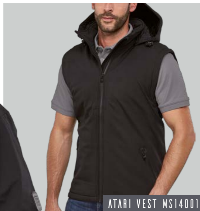
ATARI VEST MS14001