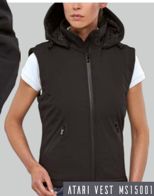
ATARI VEST MS15001