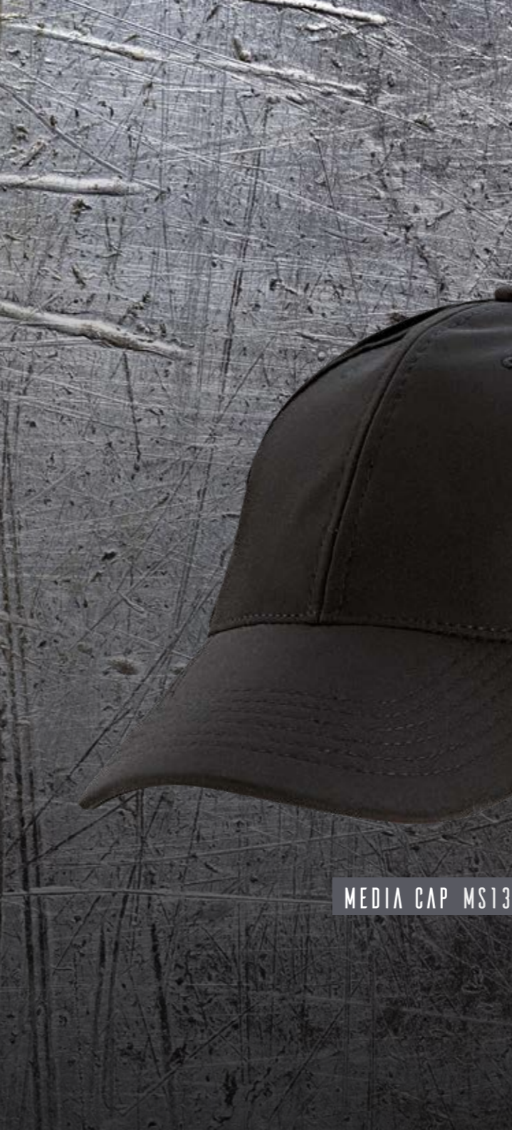
MEDIA CAP MS13001