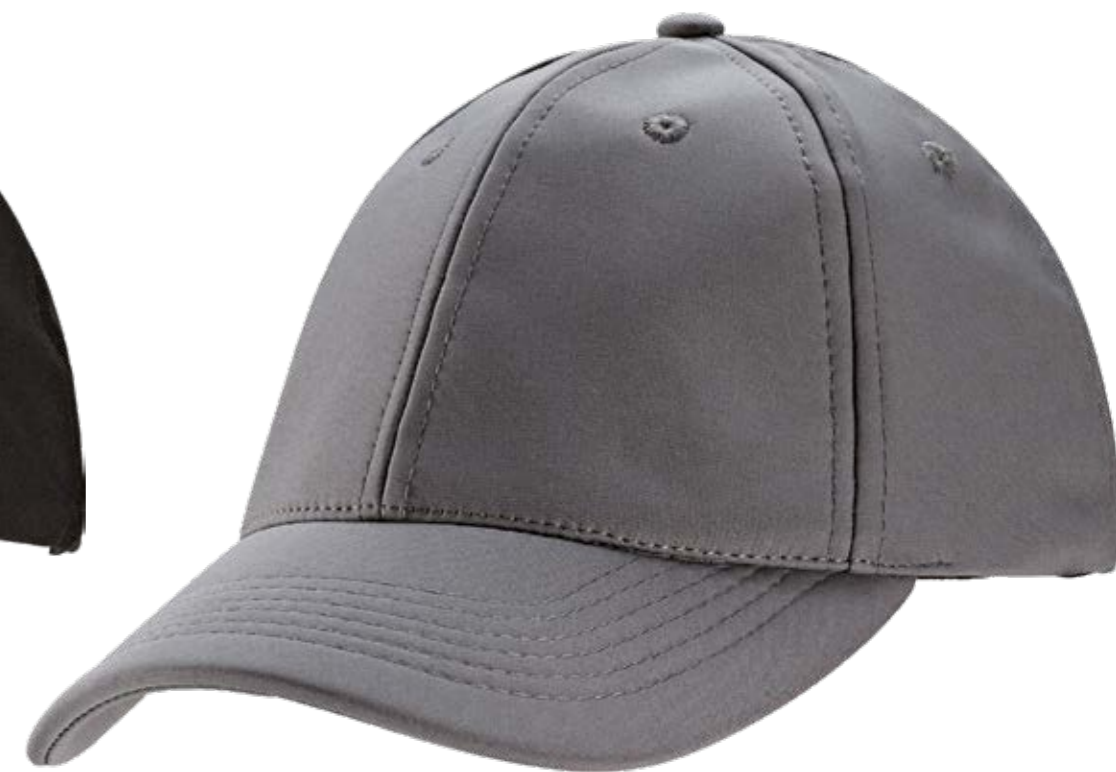
MEDIA CAP MS13003